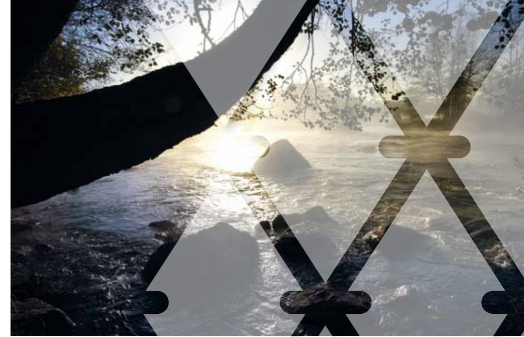
Tandem Graphics 2014. Printing: PunaMusta.